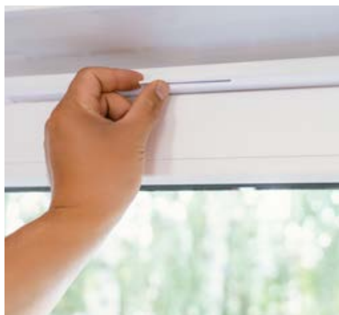
example image – please use image of products located on site if possible

Poor levels of ventilation along with excess moisture in the indoor air can contribute to mould growth, so it is important to use the ventilation provided to keep your home ‘fresh’ and to remove moisture at source, particularly from shower rooms, bathrooms and kitchens. To limit excess moisture in the indoor air and condensation in your home, the following tips may be helpful: