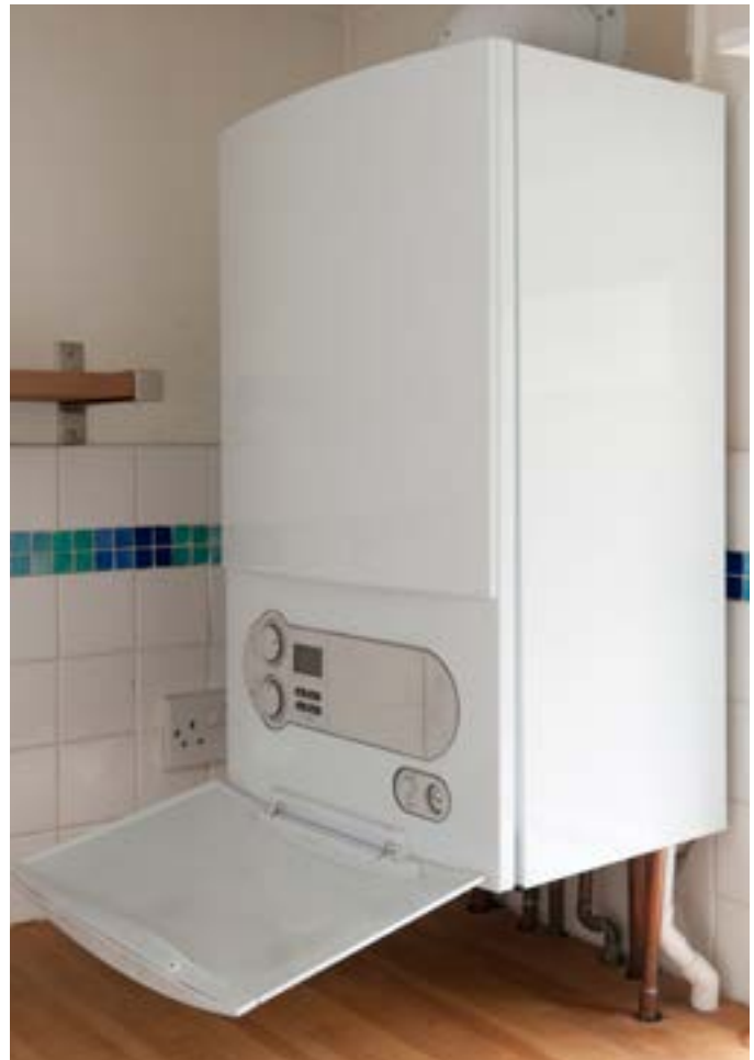
example image – please use image of products located on site if possible