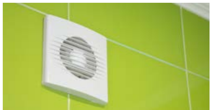
example image – please use image of products located on site if possible

Ventilation in your home has been provided using continuous mechanical extract ventilation from shower rooms, bathrooms and kitchens, with trickle vents in most window frames, and openable windows. Trickle vents are small openings fitted within all window frames except for in shower rooms, bathrooms and kitchens. When open, these allow background ventilation air flows to help to maintain good indoor air quality. Continuous mechanical extract ventilation from shower rooms, bathrooms and kitchens (sometimes via a non-recirculating cooker hood) provides background ventilation air flows to remove moisture, odours, and other indoor pollutants from your home, with fresh air supplied through trickle vents. This type of system is intended to run continuously using fans powered by electricity and should only be switched off if they are being worked on by a professional installer. Each fan can also be switched to boost mode to temporarily increase the ventilation air flows when needed. Opening windows allow for additional ventilation when needed. To allow air to circulate around your home you may have noticed that all the doors have gaps underneath them – Do not block these gaps as it will stop air flowing between rooms to those with extract fans and between trickle vents.