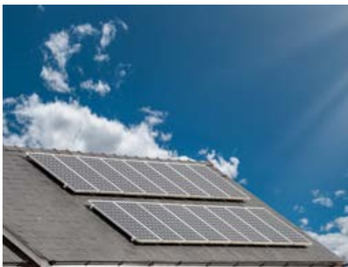
example image – please use image of products located on site if possible

At times the PV panels may harvest more electricity than your home can use immediately or store in a battery (if one is fitted). At these times the electricity will automatically be pushed (exported) back to the national grid. You may make an arrangement with your electricity supplier, so you can receive payments when electricity from the PV panels is exported from your home to the national grid.