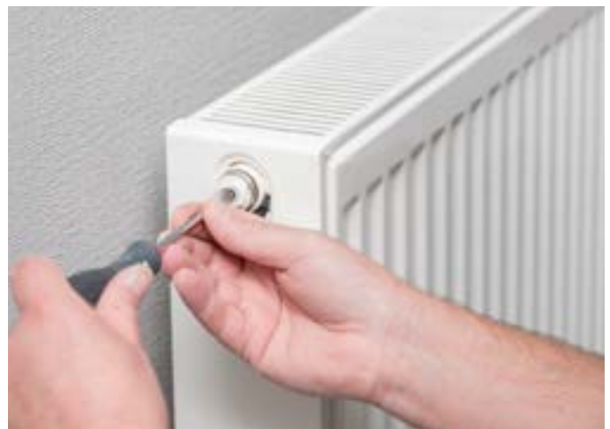
example image – please use image of products located on site if possible

Underfloor Heating [delete if not installed]: Underfloor heating is an alternative to radiators and can be an energy efficient way to heat a home. When set to run correctly, the floor should feel slightly warm and not cold. Wall thermostats will automatically control when the floor heating needs to come on and once set up, this should not require adjustment. Underfloor heating operates gently and slowly. This means it may take longer to heat up your home than you are used to after the heating has been turned down, for example while you have been away. Do not be tempted to turn up the temperature of the floor as this may lead to your home overheating.