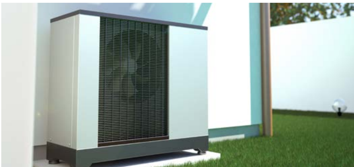
example image – please use image of products located on site if possible