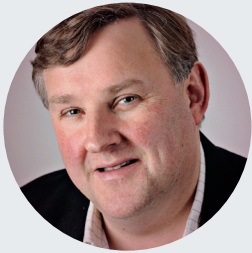
Oliver Colvile MP Chairman of the All Party Parliamentary Group for Excellence in the Built Environment

The Government is committed to building 200,000 new homes a year during this Parliament. This means that over one million new homes are expected to be built by 2020.